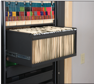
Hanging Folder Frame