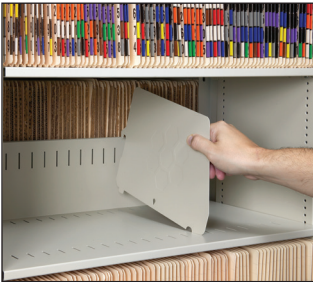
Adjustable File Dividers