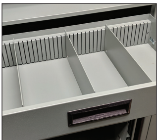
Multi Media Drawer